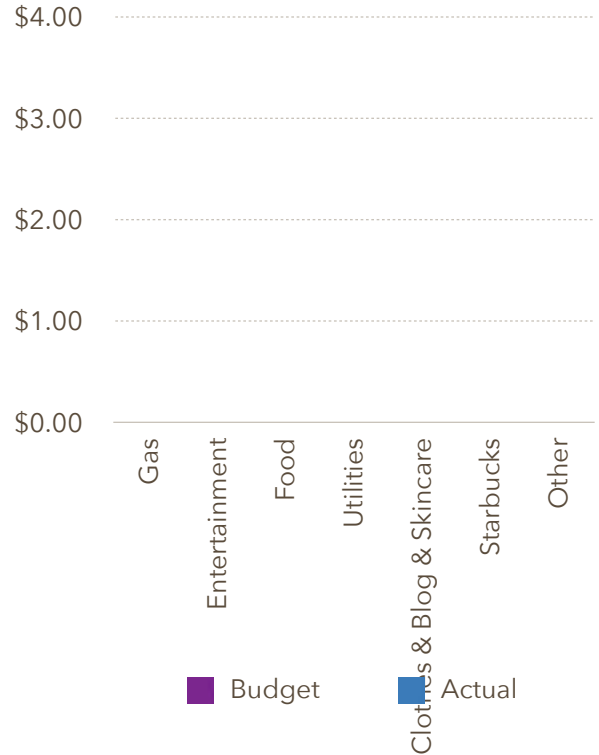
SUMMARY BY CATEGORY